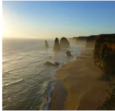
Au Pair in Australia and New-Zealand