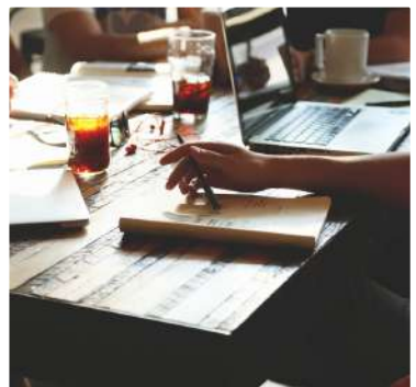
Language courses abroad