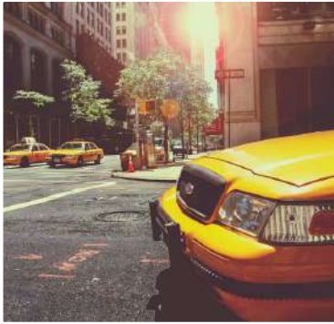
Au Pair in America