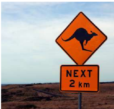
Work and travel - Work on a farm -